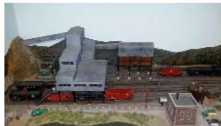
Alden Smith's HO layout