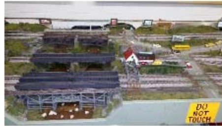
HO Layout at the Masonic Village